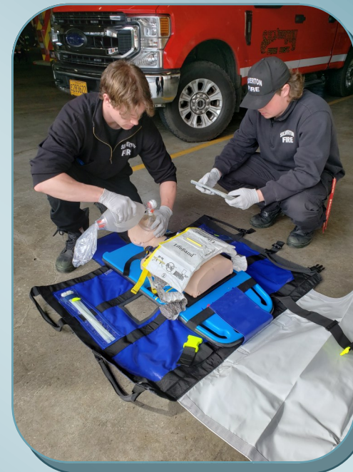
FF Tegen and FF/EMT Burton training on the District's new AutoPulse.